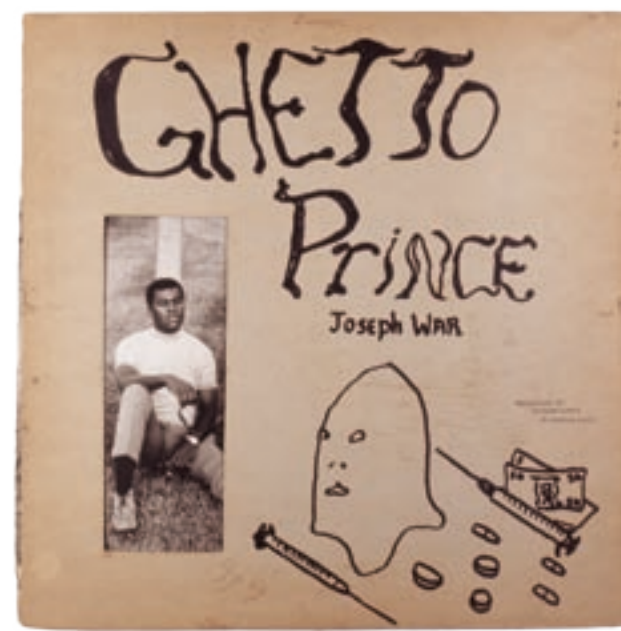
GHETTO PRINCE (recto and gatefold left) 1972 Mixed media 12½ × 12½"