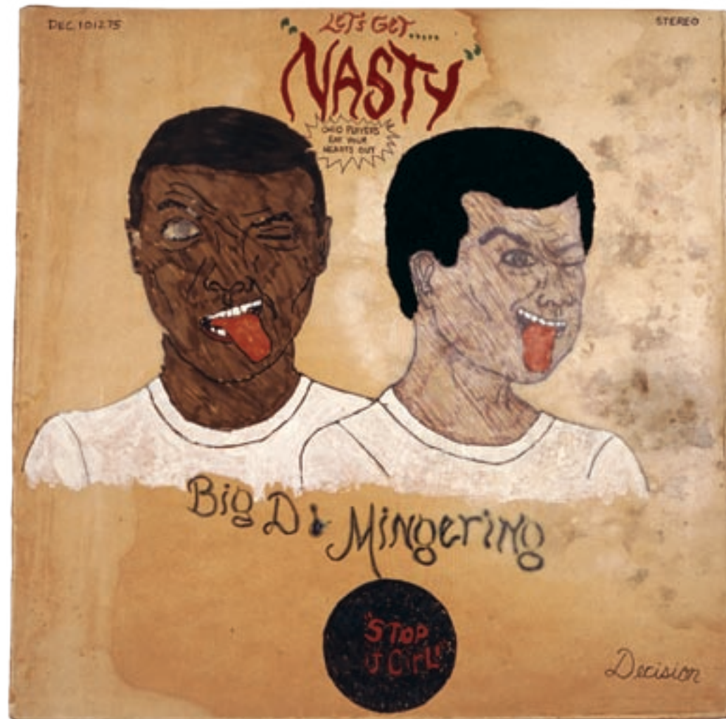
LET'S GET . . . . "NASTY" (recto and gatefold left) 1975 Mixed media 12½ × 12½"